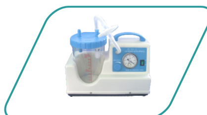
Low pressure aspirator