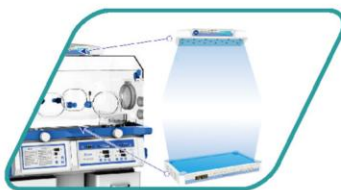
Upside LED phototherapy unit BL-30D; Downside LED phototherapy unit BL-100D;