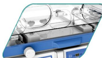
X ray cassette tray&Integrated scale